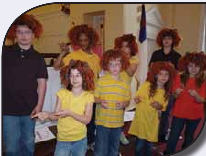
Lions, brave and bold