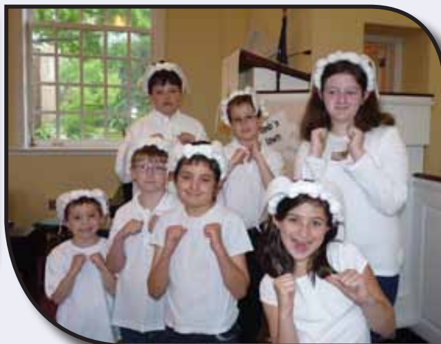
Lambs, with heart of gold